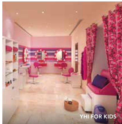
YHI FOR KIDS