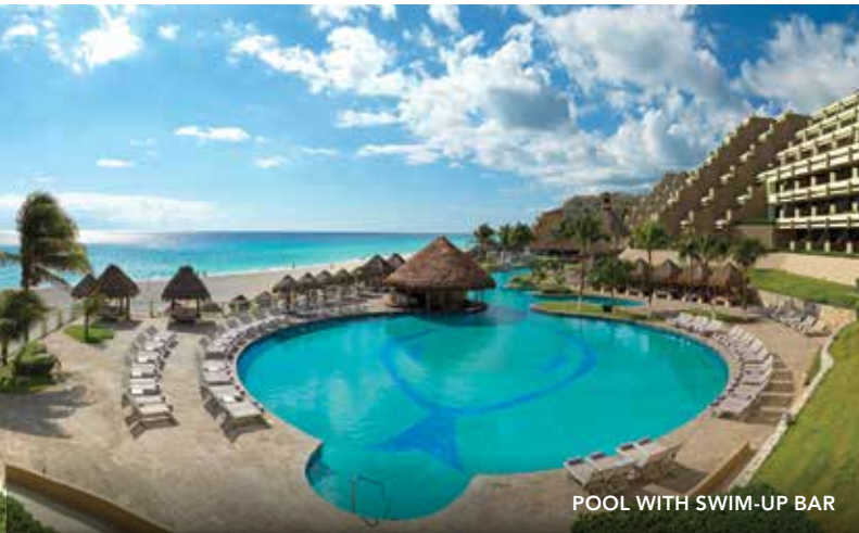
POOL WITH SWIM-UP BAR