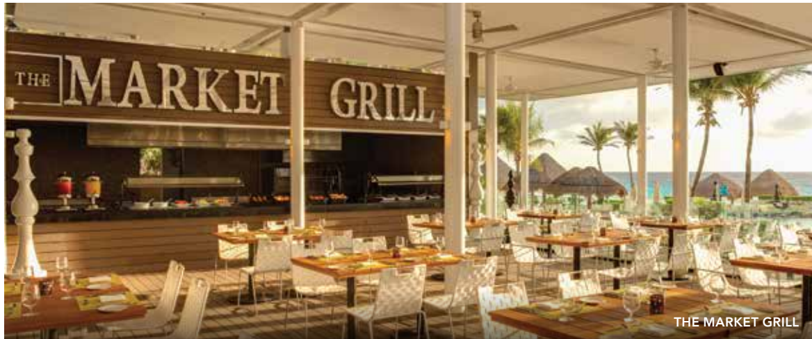
THE MARKET GRILL