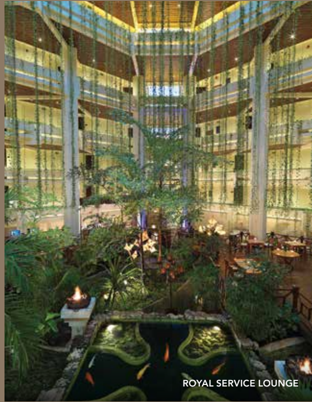
ROYAL SERVICE LOUNGE