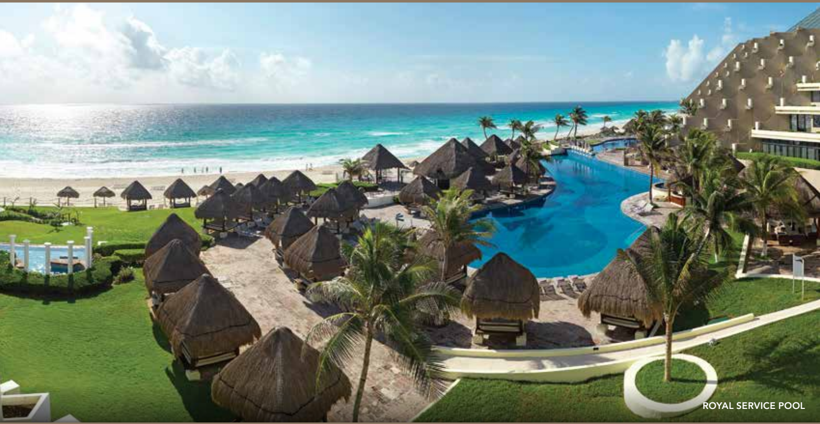
ROYAL SERVICE POOL