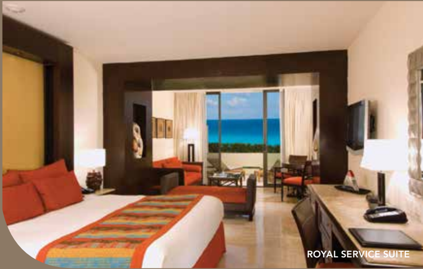
ROYAL SERVICE SUITE