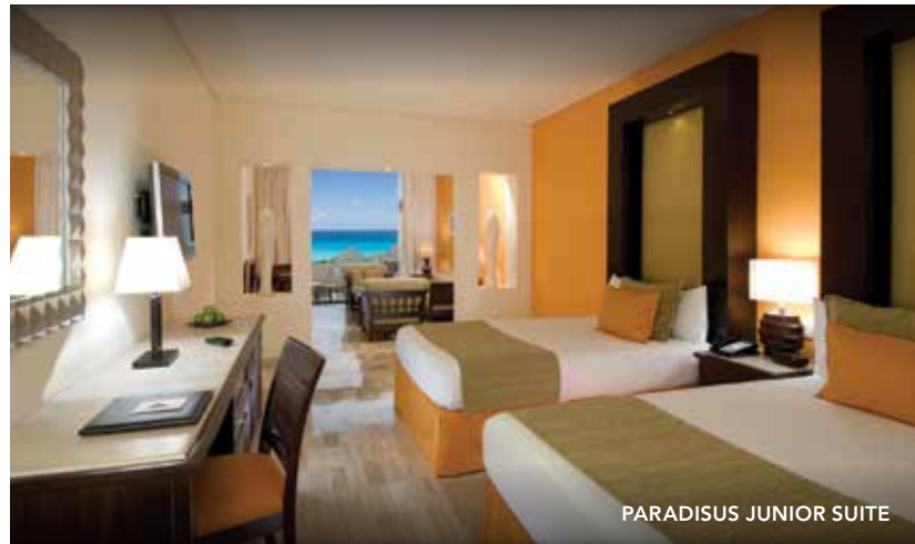
PARADISUS JUNIOR SUITE