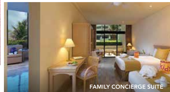
FAMILY CONCIERGE SUITE